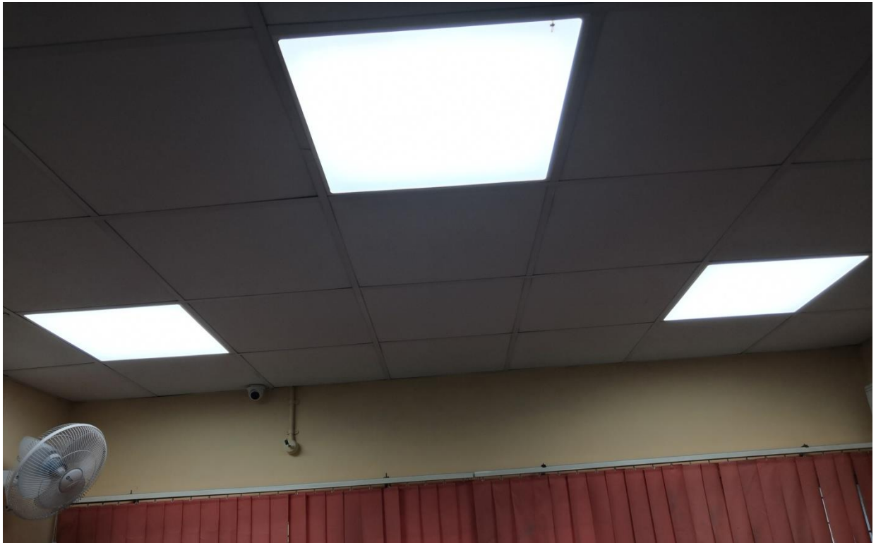
Photograph showing the LED based power efficient bulb