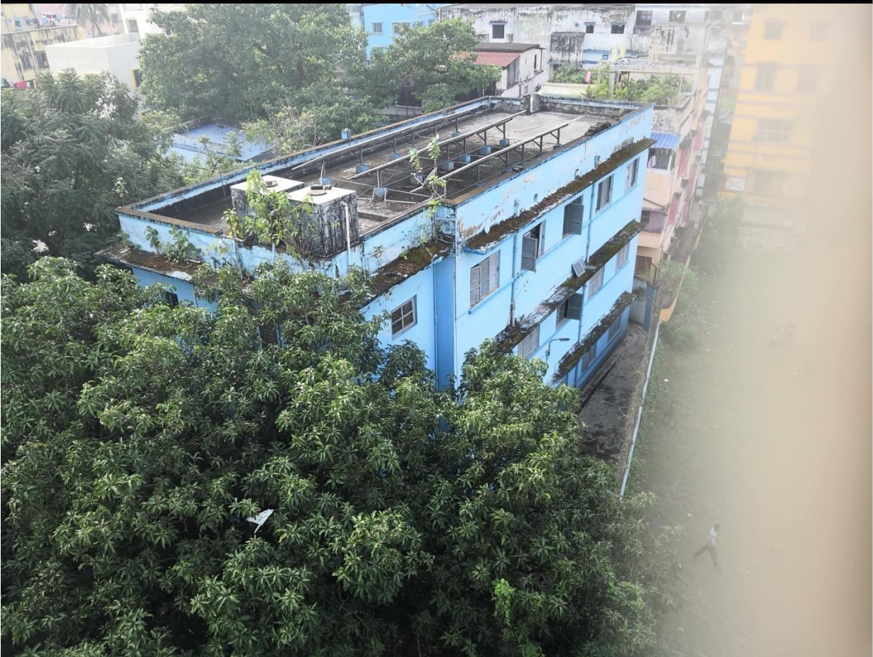
Photograph of Solar panel fitted on the roof of Computer Science and Engineering Building